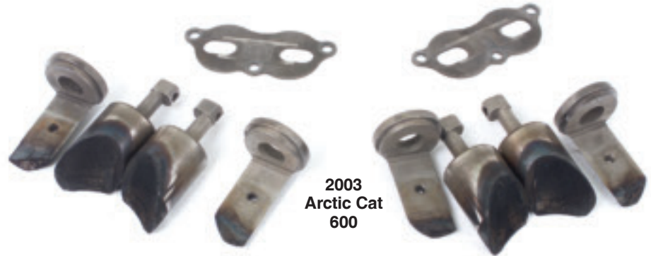
2003 Arctic Cat 600

Subjected to adverse field testing conditions in the Rocky Mountains, including long trail rides, high-RPM powder riding and steep hill climbs, AMSOIL INTERCEPTOR demonstrated superior wear protection and outstanding deposit control.