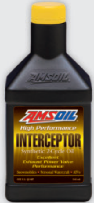
JASO FC • API TC

Extensive research and testing, including a full snowmobiling season in severe Rocky Mountain applications, has proven that wear on cylinders, pistons and bearings is significantly reduced. And with up to 30 percent more detergency and dispersancy additives than typical two-cycle oils, AMSOIL INTERCEPTOR virtually eliminates hard carbon deposits that cause exhaust power valve sticking, ring sticking and preignition-promoting “hot spots” in the combustion chamber.