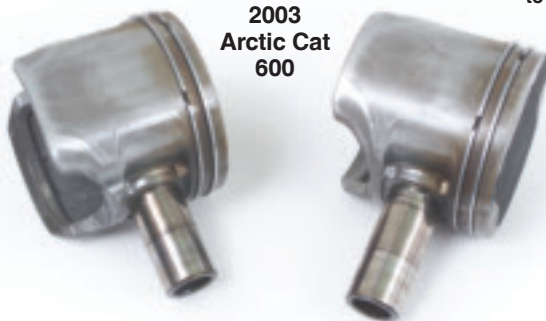
2003 Arctic Cat 600

No carbon deposits are detectable in the functioning region of the exhaust power valves, resulting in “no-stick” performance and continuous valve operation during the field trial. Note: Excess oil was removed with solvent to reveal the true condition of the valves.